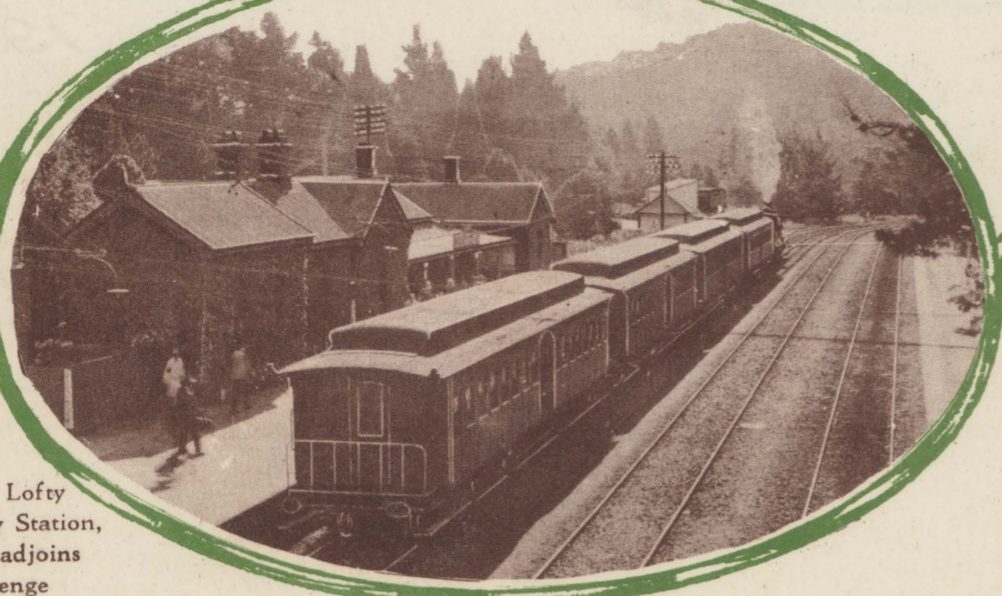
Mount Lofty Railway Station, which adjoins Stonehenge Estate.