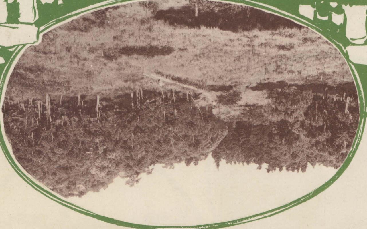
A view of Stonehenge Estate, taken from rail- way line adjoining Mount Lofty station, giving an idea of the picturesque locality.