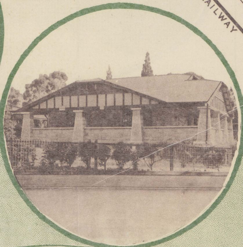
An attractive home, situated on Stonehenge Estate, to be offered for sale, if not sold before the auction.