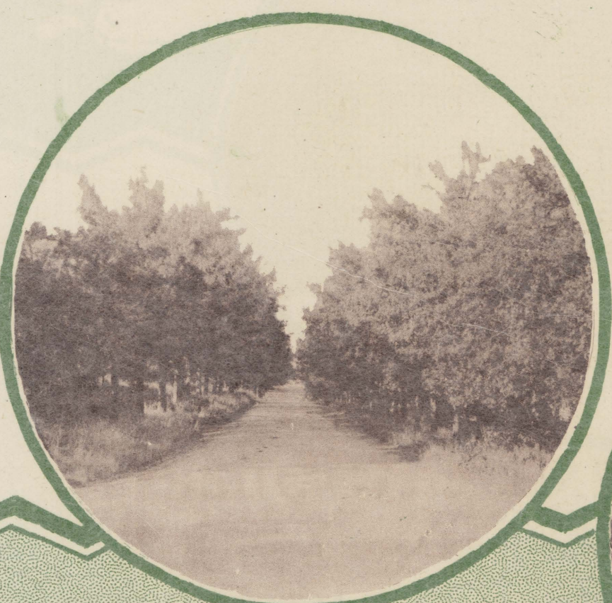
Druid Avenue, leading up to Stonehenge Estate, from main bituminous road, Stirling.